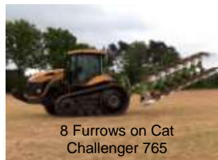
8 Furrows on Cat Challenger 765