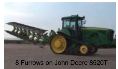
8 Furrows on John Deere 8520T