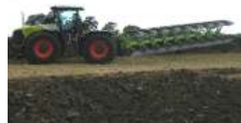
9 Furrows on Claas 5000 Xerion